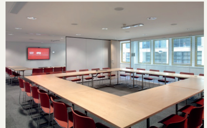
The Bastwick Suite is located on the first floor and is our most flexible meeting space.