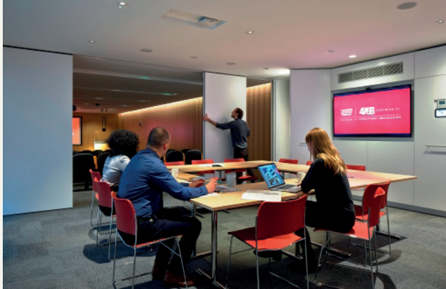
The Belgrave Suite is located on the ground floor and has direct access into the Auditorium.

Whether it's a training event, a conference, symposium or workshop, our auditorium and meeting rooms are easily arranged to suit your needs, providing you with a tailored solution at a great price.