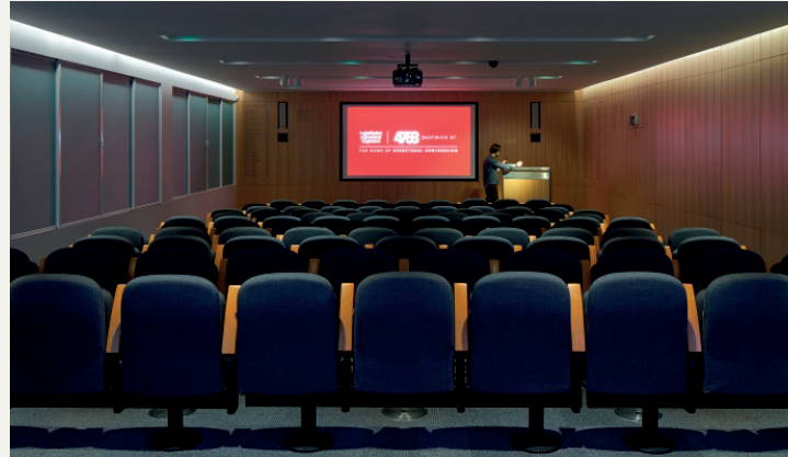
The Auditorium is a 104 seat tiered room and has modern AV facilities.