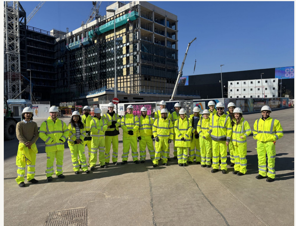
Regional Group members at a site visit to the expansion of Etihad Stadium in Manchester.

Finally, there have been numerous technicals talks with a diverse set of topics. The success of the North West could not be without the long list of speakers giving up their time for us this year.