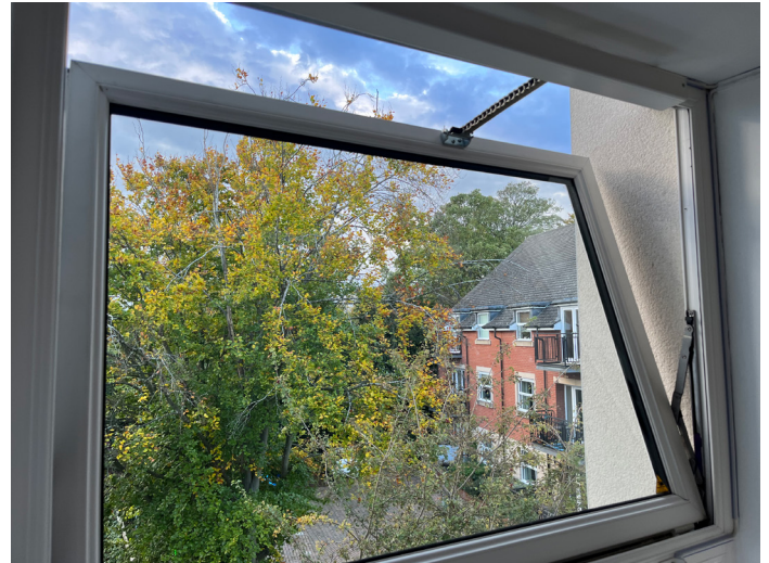
Figure 4: AOV in the open position

In England, the Responsible Person under The Fire Safety (England) Regulations 2022—Regulation 7 is also obligated to report faults in essential firefighting equipment for high-rise residential buildings. This includes when equipment is disabled.