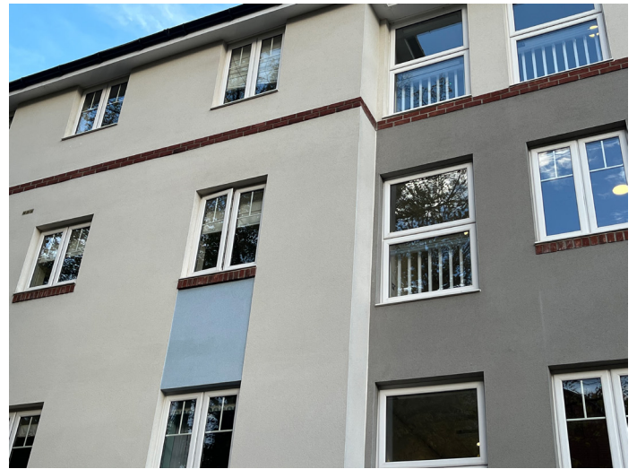
Figure 2: elevation of a residential building with AOVs – the AOVs are indistinguishable from standard windows

CROSS Safety Report 1380, Automatic Opening Vent covered during remediation works > involved a subcontractor being engaged to apply render as the final finish of the facade after remediation. Working on the exterior of the building, from scaffolding, the subcontractor's operatives took measures to protect the AOVs from the render that was to be applied. There may have been no sign or indication that the AOVs were not standard windows. The applied masking would have prevented the vents from opening in the event of a fire.