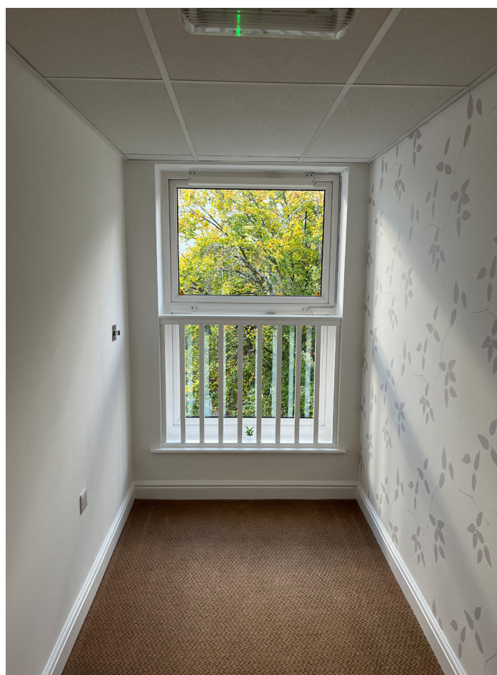
Figure 1: internal view of an AOV

Region: CROSS-UK / CROSS-US / CROSS-AUS Published: November 2024