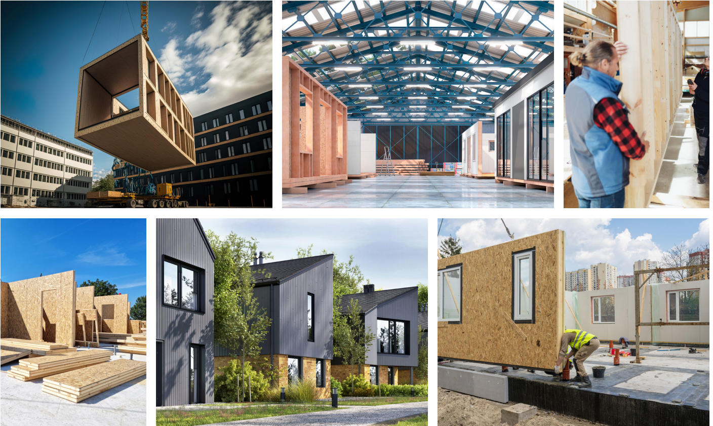
Figure 3: Examples of MMC use in construction