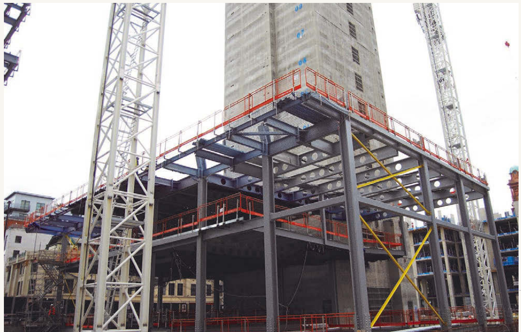
◀ An erected steel frame on site

Steel structures are often prototyped or trial built off-site to ensure a perfect fit when the fabricated steel modules undergo final assembly on site. This means that the majority of the value add for structural steel occurs off-site.