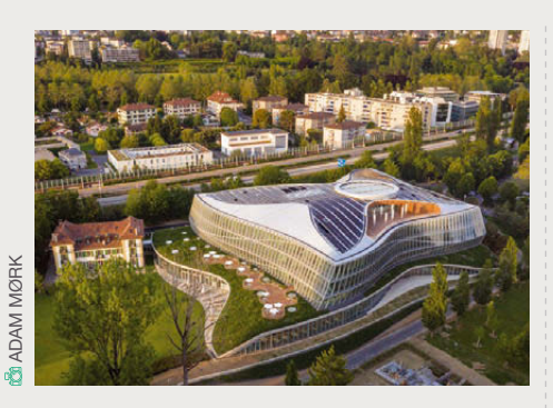
IOC Olympic House Lausanne, Switzerland Submitted by: INGENI