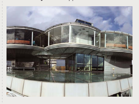
Guinness Storehouse Gravity Bar Extension Dublin, Ireland