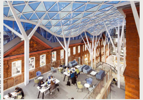
Heartspace - University of Sheffield

Esslingen, Switzerland Submitted by: Basler & Hofmann AG