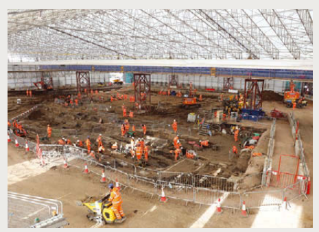
St James' Garden

Soldeu, Andorra Submitted by: Helium Engineering