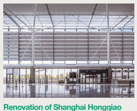
International Airport Terminal 1 Shanghai, China Submitted by: East China Architectural Design and Research Institute