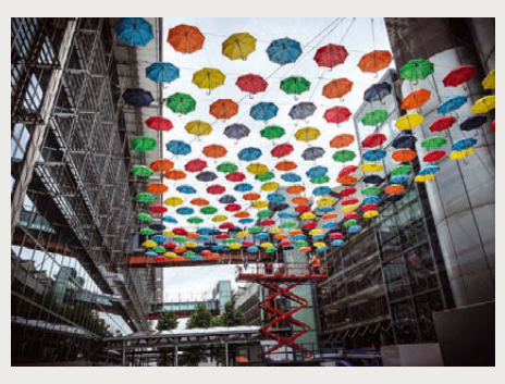
Umbrella Project, Heathrow Airport Heathrow, UK Submitted by: BakerHicks