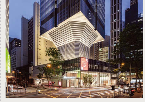
One Hennessy Wan Chai, Hong Kong Submitted by: Ove Arup & Partners Hong Kong Ltd