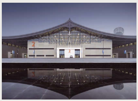
Shijiazhuang International Convention and Exhibition Center

Shijiazhuang, China Submitted by: Architecture Design & Research Institute of Tsinghua University