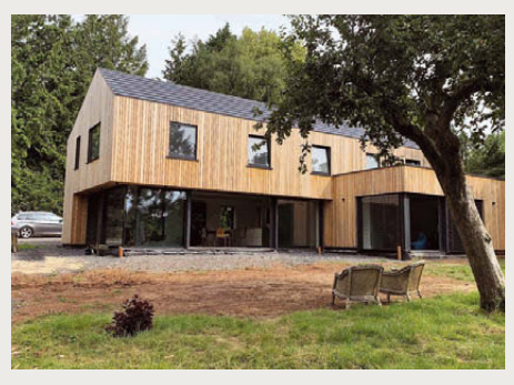
Dorset House Bristol, UK Submitted by: Element Structures