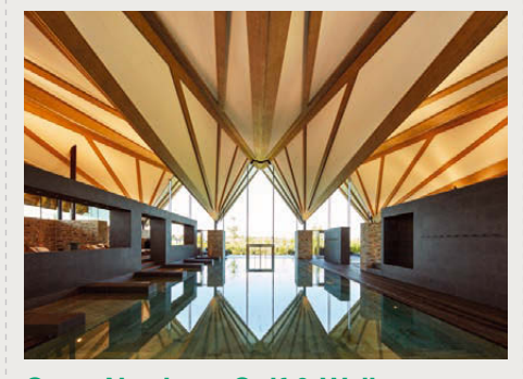
Great Northern Golf & Wellness Kerteminde, Denmark Submitted by: Søren Jensen Consulting Engineers

Beijing, China Submitted by: Beijing Institute of Architectural Design