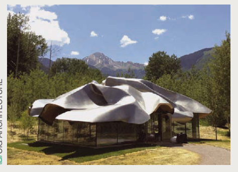
Meeting House Aspen, USA Submitted by: AKT II