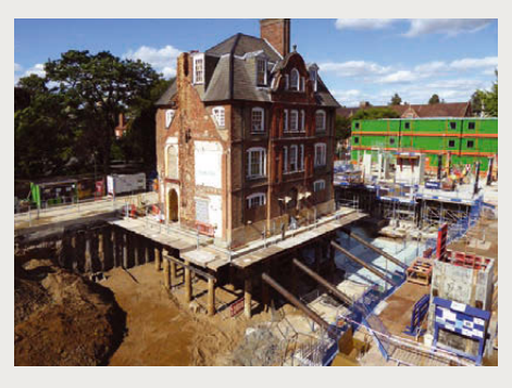
Transformation of Acland House