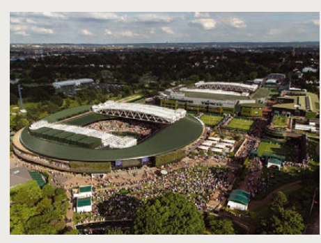
Wimbledon Court No.1 Redevelopment