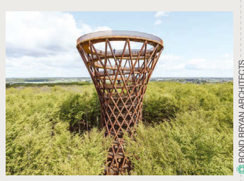
Camp Adventure Forest Tower

Sydney, Australia Submitted by: Partridge