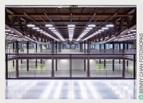
1 Finsbury Avenue London, UK Submitted by: Arup

Showcasing projects that championed sustainable techniques, retained existing structures, embraced the circular economy and benefited society.