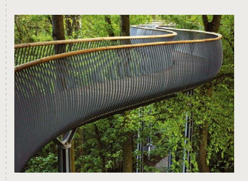
The Viper Elevated Walkway at the Newt in Somerset Castle Cary, UK