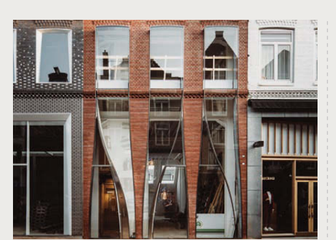
138 P.C. Hooftstraat – The Looking Glass

Showcasing unique structures that required a creative approach to engineering design and/or the use of digital design tools.