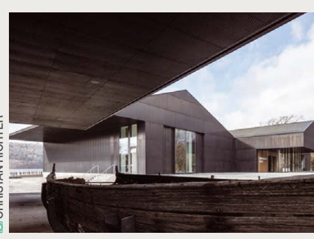
Windermere Jetty Museum Lake District, UK Submitted by: Arup