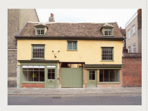
33 & 34 Trumpington Street Cambridge, UK Submitted by: Wright Consulting Limited