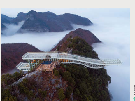
Skyboat Guangxi, China Submitted by: XinY Structural Consultants

Shijiazhuang, China Submitted by: Architecture Design & Research Institute of Tsinghua University