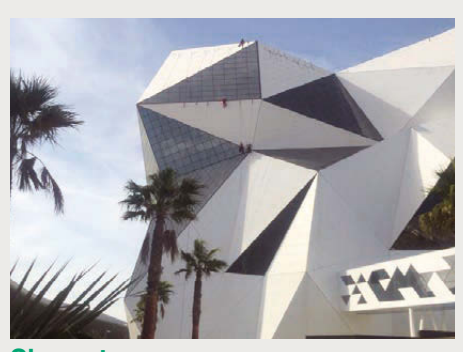
Skyventure Abu Dhabi, United Arab Emirates Submitted by: Inhabit