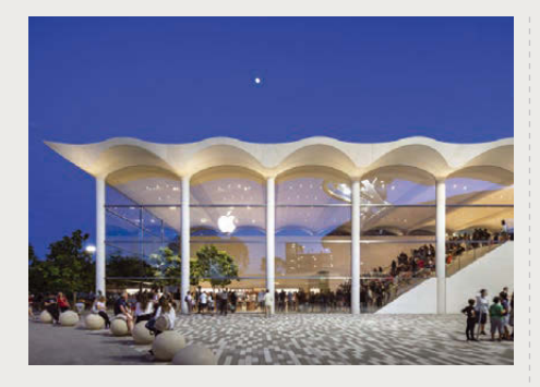
Apple Aventura Aventura, USA Submitted by: Foster + Partners

Showcasing structures created through a close collaboration between engineer and architect.