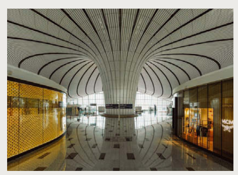
Beijing Daxing International Airport Terminal

Beijing, China Submitted by: Beijing Institute of Architectural Design