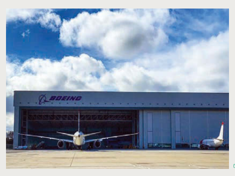
Boeing Goldcare Gatwick – Aircraft Hangar Gatwick, UK Submitted by: Mott MacDonald