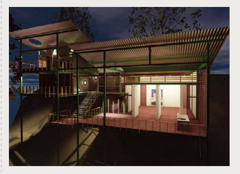
North Coast Studio Port of Spain, Trinidad & Tobago Submitted by: GL&SS