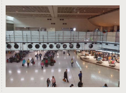
North Terminal Mezzanine Gatwick, UK Submitted by: Webb Yates Engineers