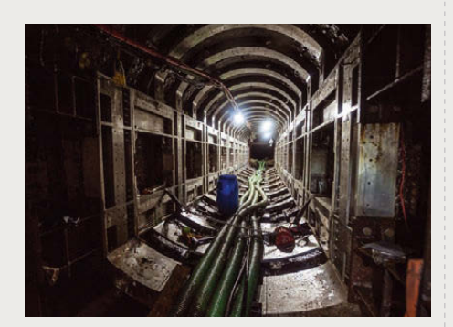
King's Scholars Pond Sewer Rehabilitation

London, UK Submitted by: Thornton Tomasetti