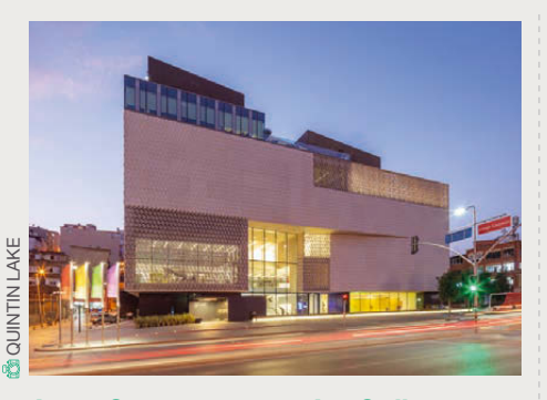
Arter Contemporary Art Gallery Istanbul, Turkey Submitted by: Thornton Tomasetti

Showcasing structures that overcame challenging site conditions, extreme environmental factors and short construction sequences.