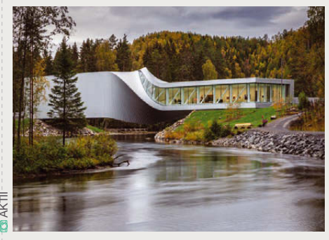
The Twist Kistefos, Norway Submitted by: AKT II

Dubai, United Arab Emirates Submitted by: NORR Group Consultants International Ltd