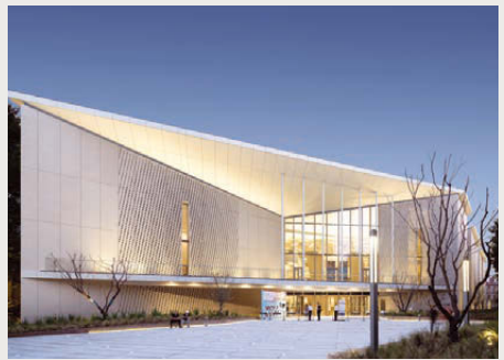
Shangyin Opera House

London, UK Submitted by: Integral Engineering Design