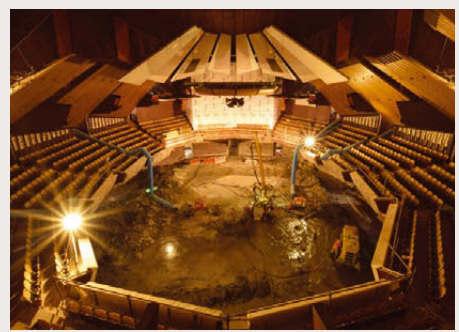
Christchurch Town Hall Christchurch, New Zealand Submitted by: Holmes Consulting LP