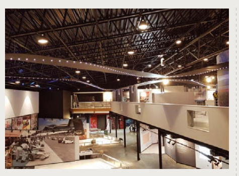
The Silverstone Experience

London, UK Submitted by: Heyne Tillett Steel