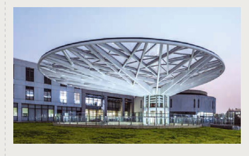
Zhangjiang International Brain Imaging Centre

Panama City, Panama Submitted by: Foster + Partners