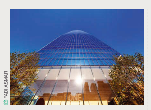
One Manhattan West

New York, USA Submitted by: Skidmore, Owings & Merrill