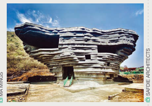
Chapel of Sound Hebei, China Submitted by: Arup