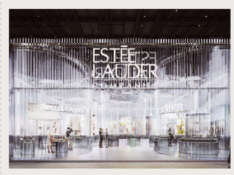
Estée Lauder Companies Pavilion CIIE 2019

Qingdao, China Submitted by: XinY Structural Consultants