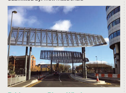
Bridgewater Place Wind Amelioration Scheme Leeds, UK Submitted by: Buro Happold