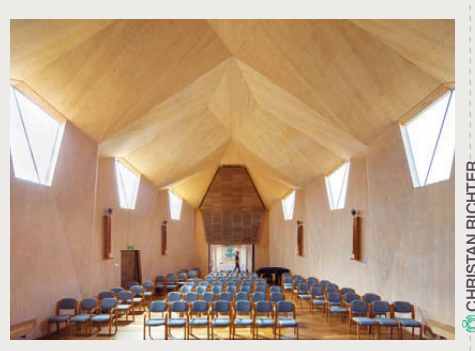
Stroud Christian Community Chapel Gloucestershire, UK