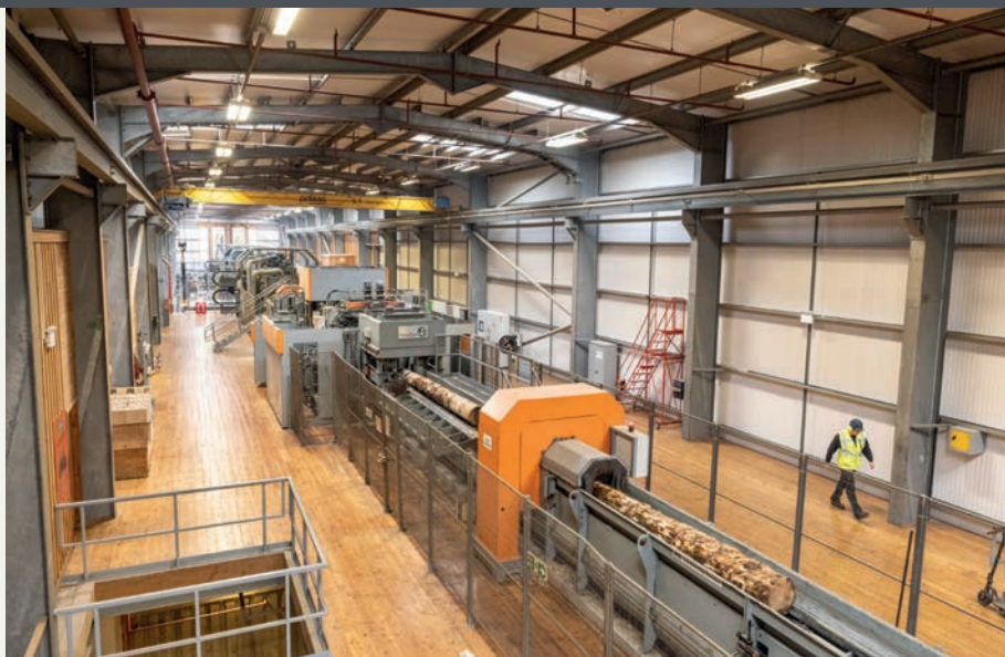
➤ FIGURE 2: Processing of timber

utilised strength classes of structural softwood timber in the UK. They are just two of the strength classes defined across Europe under Standard EN 338. The UK also uses the non-EN 338 strength class TR26 for trussed rafters.