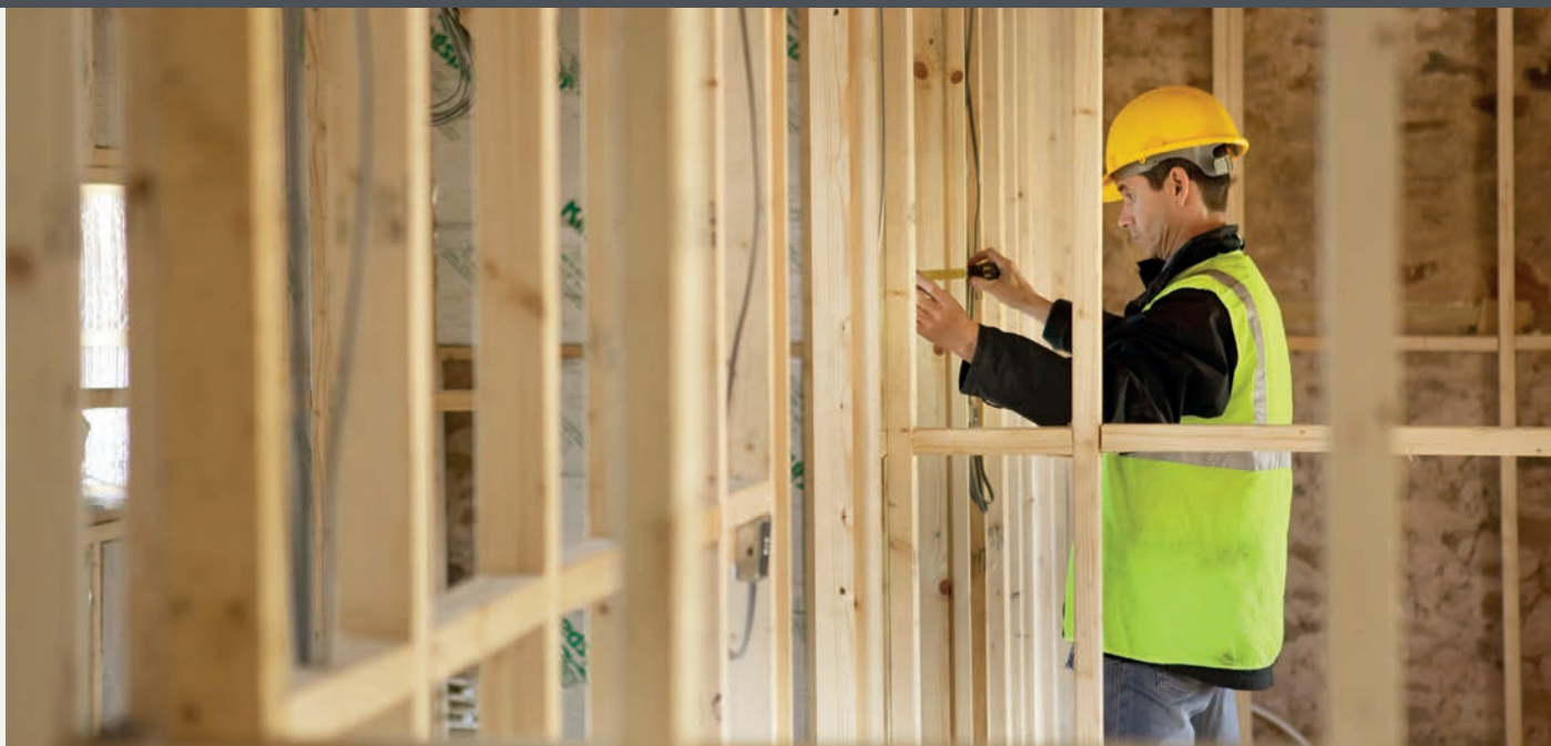
FIGURE 3: Carcassing with machined timber

position of knots, or by acoustic vibration assessment of stiffness. Machine grading is well suited to assessing large volumes of timber quickly and consistently and is therefore widely adopted by larger UK sawmills.