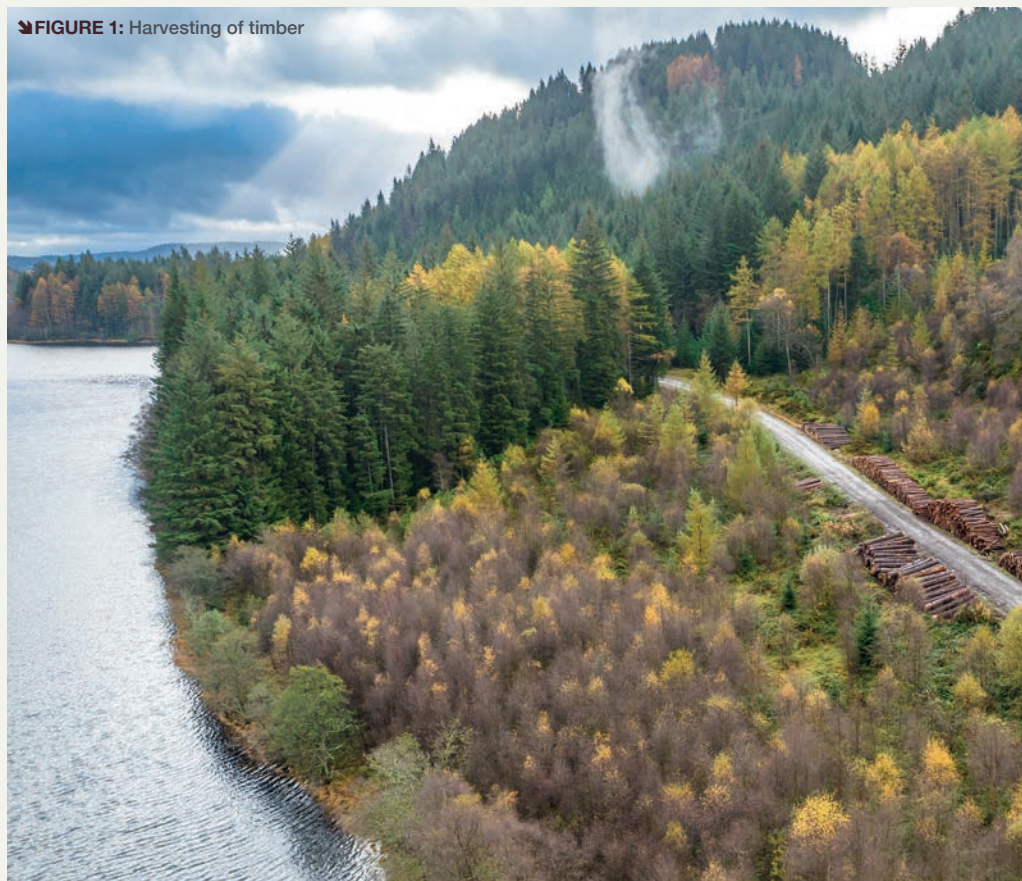
FIGURE 1: Harvesting of timber