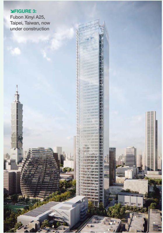
FIGURE 3: Fubon Xinyi A25, Taipei, Taiwan, now under construction

Noding out braces inboard of the corner columns helped distribute reactions on the foundations, saving raft thickness and pile length. However, on other items such as the five-storey glass screens on top of the tower, these were regarded as fundamental to the architecture despite an evaluation of the potential column size reduction. As so many other key efficiency drivers were maintained, the building was still realised with one-third lower steel tonnage than the local benchmark.