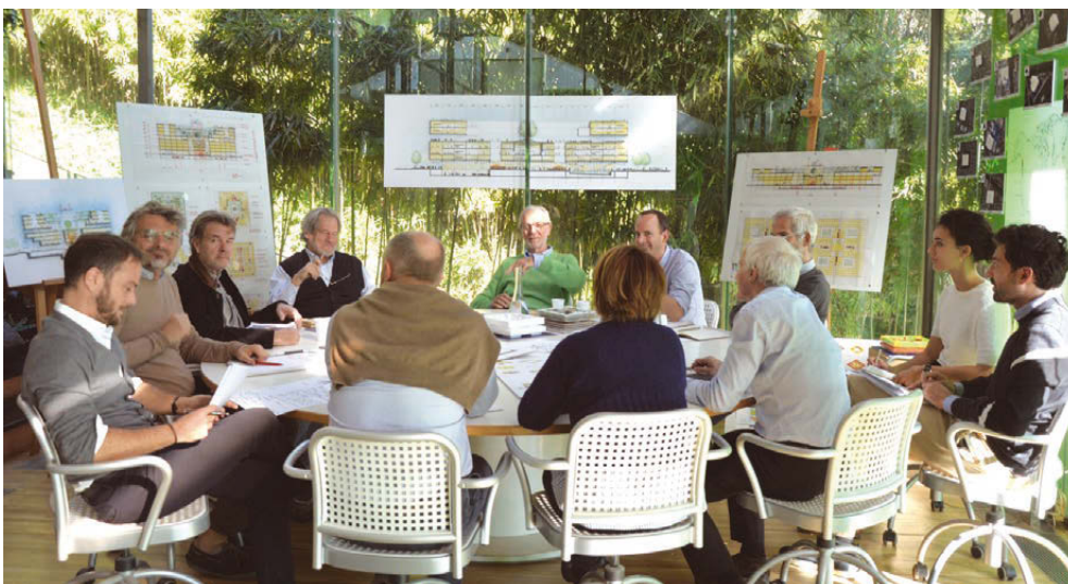
FIGURE 2: Early design meetings with architects and clients, at the 'fat pen and foam model' stage, may offer the best opportunity to influence the project to achieve sustainable outcomes. Example shows early design meeting on Whittle School and Studios at Renzo Piano Building Workshop, Genoa

Keep in mind the immediate impact of your own decisions. If reviewed by an external competitor, could they present a more economical (less resource-intensive) scheme for the project? But we should go further and aim to get to a position where we can ask our architect: if a carbon-conscious architect reviewed the project, what changes or tweaks might they have suggested to unlock resource reductions?